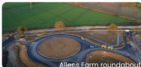
Allens Farm roundabout