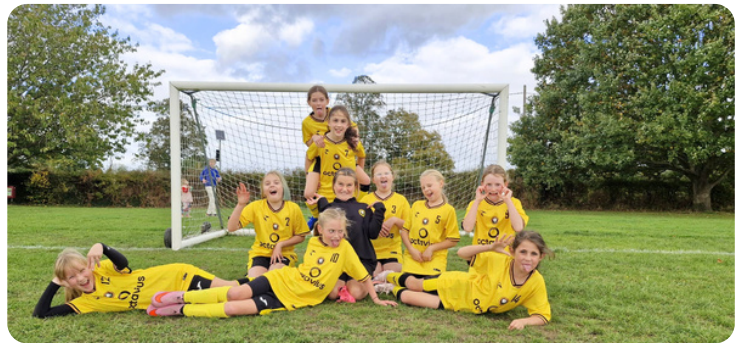
Stanway Rovers Wasps