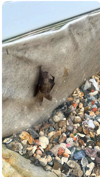
Brown, Long-Eared Bat