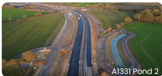
A1331 Pond 2