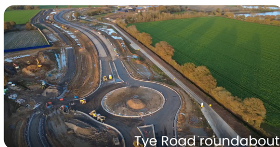
Tye Road roundabout